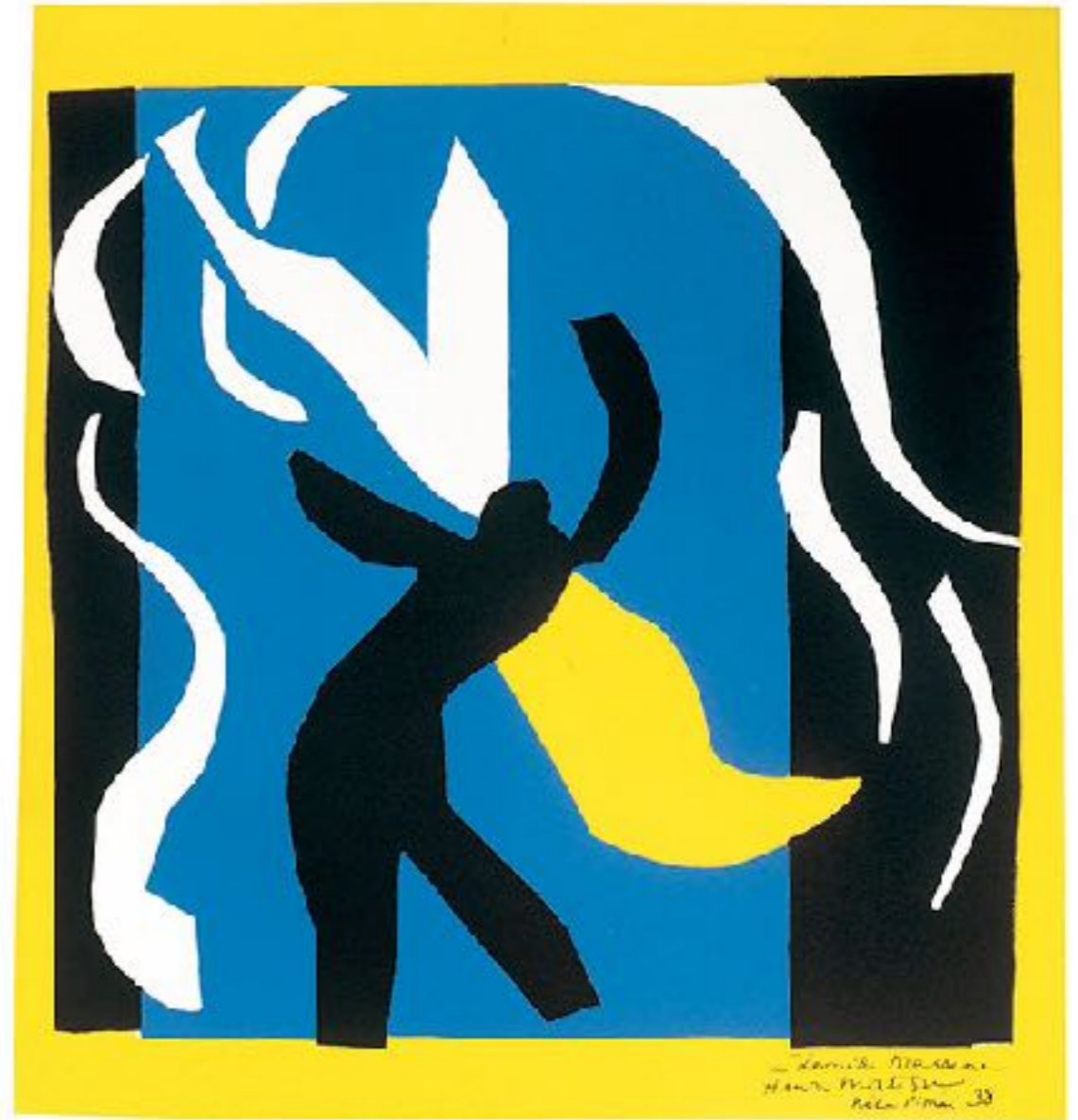
The Dance, 1917-18 Study for the curtains of the ballet "L'Étrange comédie" Couché en papier, sur un papier en papier, 51 x 61 cm. Musée collection, lithographie reproduite de l'original papier en-creu