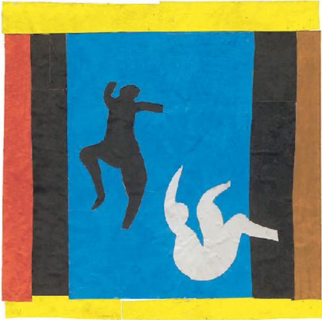
Two Dancers, 1917-18 Study for the curtains of the ballet "L'Étrange comédie" Couché en papier, sur un papier en papier, 61 x 52 cm Private collection